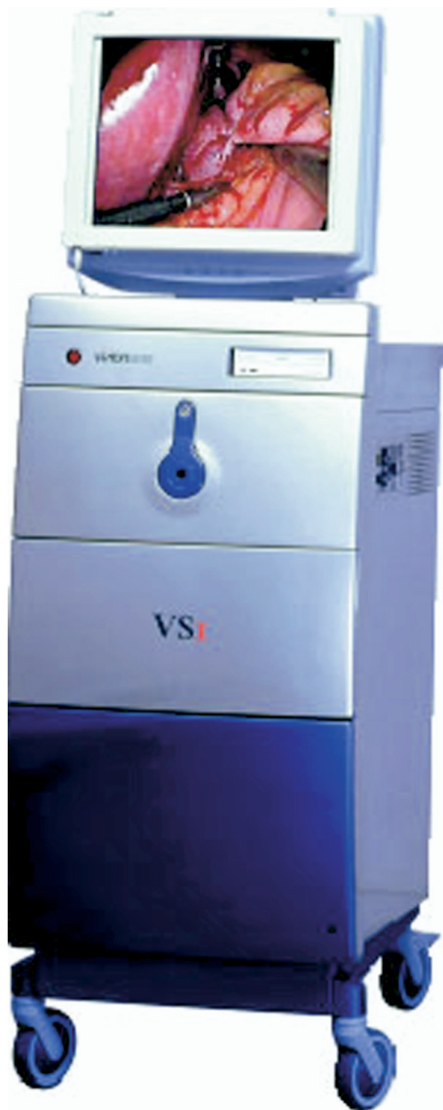
Figure 2 The display tower of the 3D system. The endoscope and camera are combined as a single unit that is connected to the display tower.

decrease the barrier of entry into endoscopy by surgeons experienced with microscopic binocular vision. Future applications of this technology include the ability to fuse an